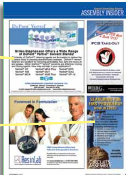
1/6 Assembly Insider