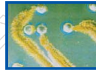
FIGURE 2: Copper sulfate corrosion.