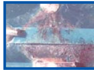
FIGURE 1: Electrochemical migration.

Are residue-related problems becoming more common? Many problems have been misdiagnosed, and new designs have a much higher level of circuit sensitivity. Many EMS firms have seen large increases in no trouble found (NTF) returns. These returns encountered an event in the field, but by the time the units were retested at the bench of the EMS the problem disappeared because the residues dried between time of failure and shipment to be tested. For a good environmental check, place the units in high humidity (35°C/65%RH) overnight, and then retest in the morning. If the units fail, the failure is residue-related. (Watch for follow-up columns on specific area cleanliness and how to address it.)